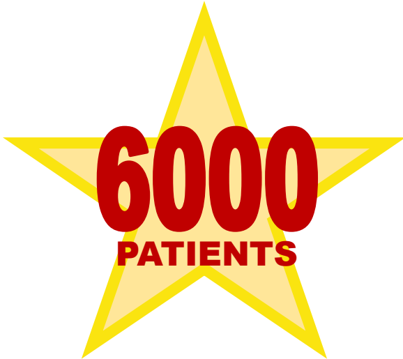
Patients recruited as of 30 January 2017